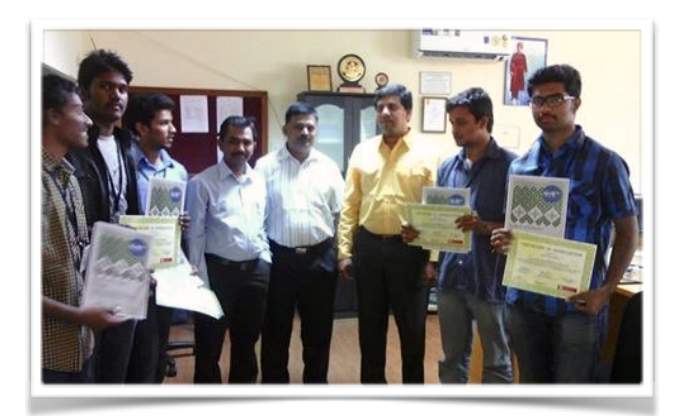
Quince Aventadors being congratulated by the Principal and HODs

6.Fifteen students from B Tech III year Mechanical Engineering department have secured 6th place in a national level Eco Kart 2015 organised between 9th and 14th of February 2015 by Gautam Buddha University at Greater Noida.