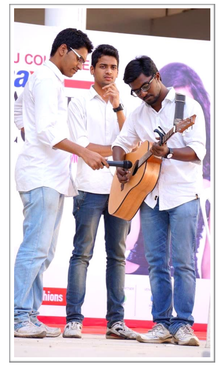
Talent show at Red FM MFI