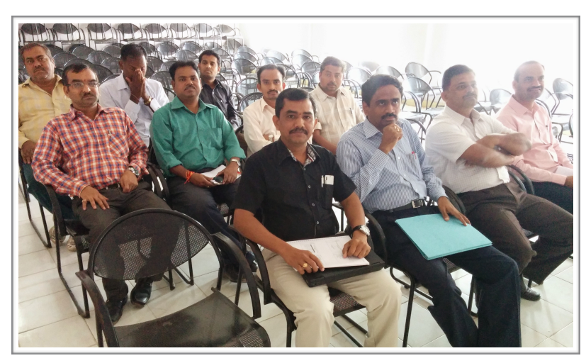
Teaching and Non Teaching Staff participating in Quality Improvement Programme