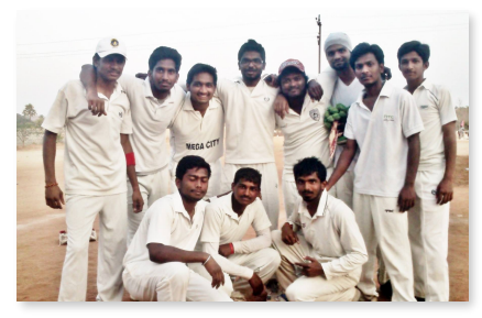
2015. The team has played well and reached till semifinals and lost. However they were presented with an award for best performance in the tournament for their fair game.

The college Cricket Team has participated in Nalgonda District Tournament organised at Valigonda in which 60 teams have participated from the Nalgonda District in February