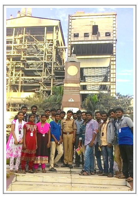
B Tech III Year EEE students with staff of Kothagudem Thermal Power Station