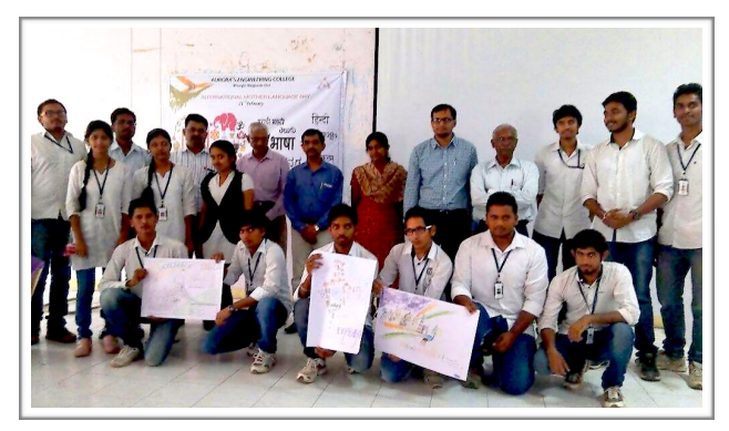
Participants of International Mother Language Day celebrations along with organisers during closing ceremony