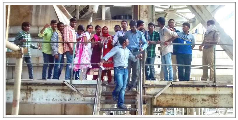
B Tech III Year EEE students at Kothagudem Thermal Power Station on 28th February 2015 on an Industrial Visit