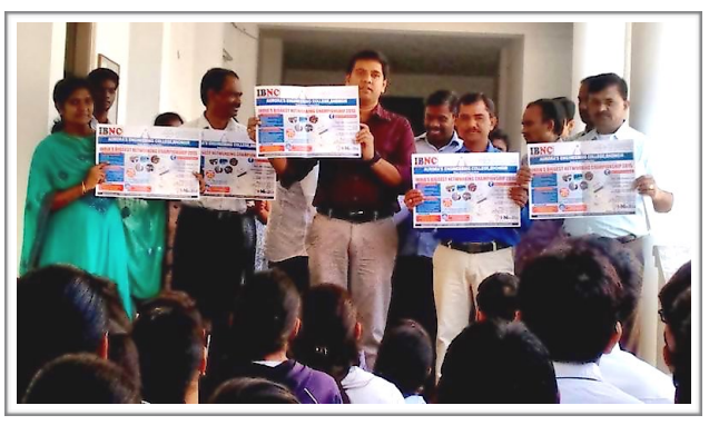
Poster release of India's Biggest Networking Championship IBNC 2015 by the Principal, HODs, and senior staff members