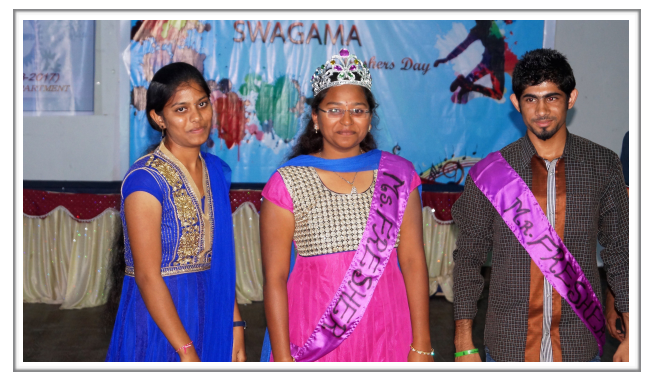
Mr. Fresher and Ms. Fresher title winners in Freshers Day Programme, Swagama