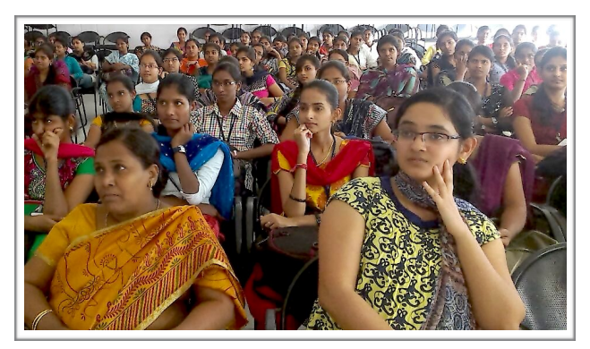
All women participants attending a lecture on Bliss of Health