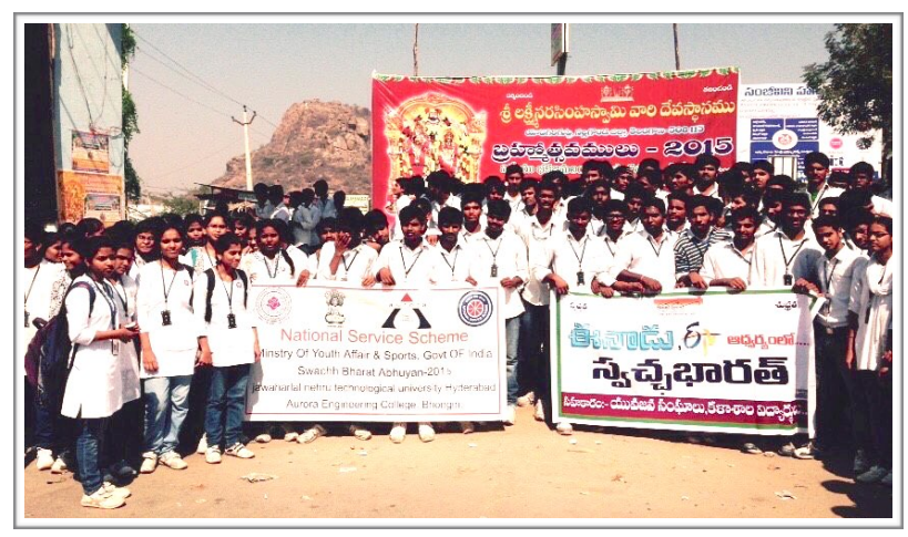
B Tech I Year students participating in Swachh Bharath Rally at Raigiri